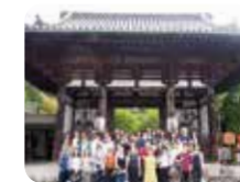
Bus trip for international students (Ishiyama Temple)