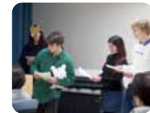
Joint presentation for the KOJSP Japanese language course