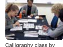
Calligraphy class by a professor from the Japanese Literature department